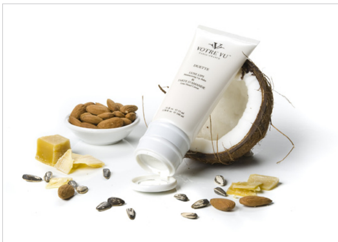
Votre Vu's Almond Hand and Lip Balm