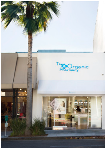
The Organic Pharmacy