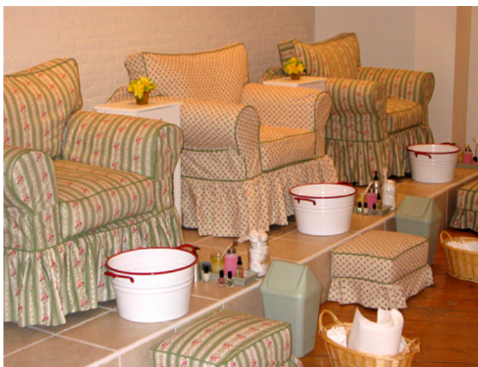
Sweet Lily Natural Nail Spa and Boutique